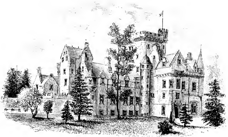
MOY HALL, INVERNESS-SHIRE. WEST FRONT.

Printed for the Author by R. CLAY, SONS, AND TAYLOR, LONDON